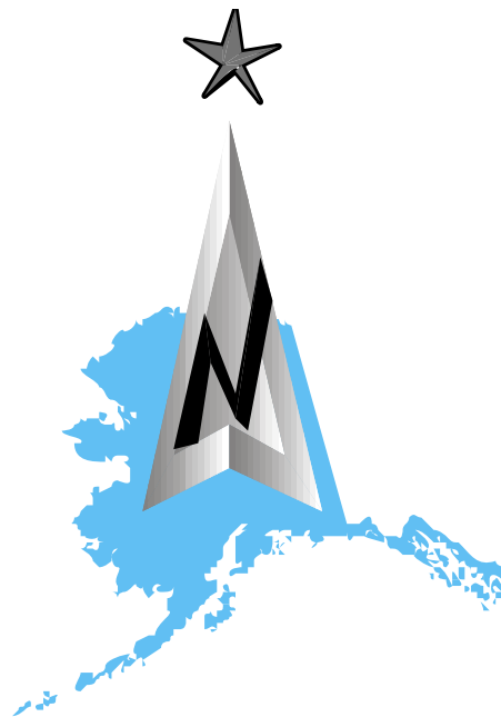
Mapmakers Alaska office in downtown Palmer, Alaska.

Call us for an appointment at 907-745-3398