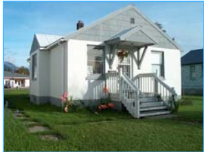
Mapmakers Alaska office in downtown Palmer, Alaska.

Our custom maps, on paper or in digital format, are proven and convincing exhibits in board rooms, "war" rooms and court rooms. Numerous publications for environ-